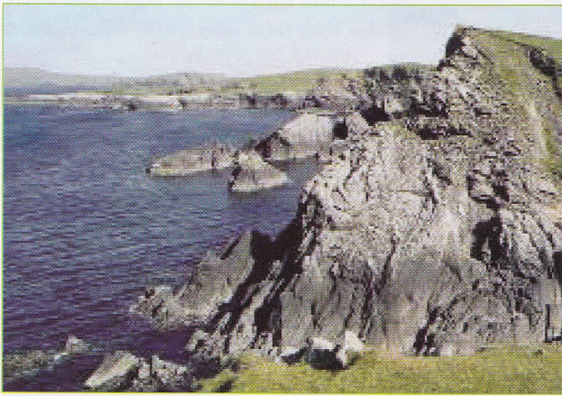
Fig 3 The sea routes between the many small islands of the Shetlands were not very well-known but the possibility of being confronted with the British enemy or buccaneers along the coast of the continent was considered by the Netherlandish merchants as more dangerous than trying to pass the treacherous coasts of the Shetlands. – http://www.shetlandhamefarin.com

According to a paper by M Christopher Dobbs about the excavation of the cargo ship ‘Kennemerland’ (see hereafter) Robert