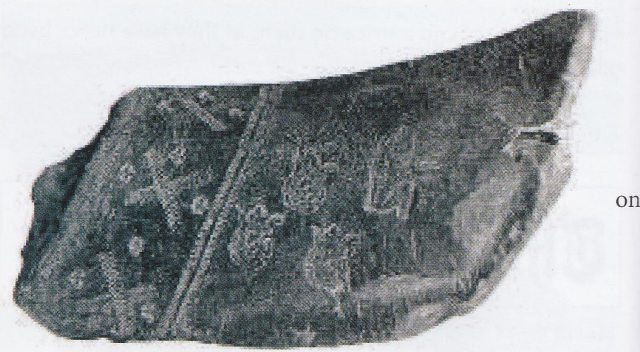
Fig 6 Picture of the somewhat-rounded back of the least damaged club head. The slof weighs 300 gram and, is 103 millimetres long and 42 millimetres high. The thickness of the shell wall is 3.4 millimetres. The club head is decorated with double-striated lines, three Andreas crosses and three crowned roses. Also the letter D and perhaps I are visible. The meaning of these letters is unknown. –