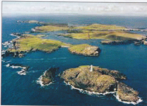
Fig 5 The Kennemerland stranded during a heavy storm on the rocks near the Stoura Stack of the Out Skerries. From the hundred-fifty crew members only three men survived. The routes between these small rocky islands were not well-known. A heavy storm could easily swipe a ship off course. Many other not yet discovered ships maybe sunk near the Shetland Islands.

Slofs made of lead alloy make lower prices on auctions than the rare brass slofs. The value depends on the finding place, the state of preservation and possible marks of the club maker, the