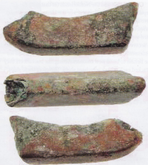
Fig 4 One of the Lastdrager’s brass slofs seen from different angles; the strike face, the top and the back of the head. The club head is covered with green patina over orangish surfaces, triangular in cross section with an upward sloping end. The hard brass metal of the slofs could stand the constant movement of the sea very well. They are almost undamaged.

The brass metal as used for the heads was exceptional. Until now in land-excavations only lead and lead alloy colf club heads (slofs) were found. The dimensions are not much different from the leaden heads. The length of three of the brass slofs was 99 millimetres; the fourth one measured only 91 millimetres. The weight of this small slof, 145 grams (including the wooden insert), could mean that it was the head of a children’s colf club. The weight of the other heads was respectively 226 grams (including the wooden stump), 205 grams (also including the stump) and 189 grams (excluding the wooden remains). All pieces are cast brass hollow shells with an opening at the rear end in which the ash shaft was inserted. The thickness of the brass shell varies between 2.9 and 3.5 millimetres. The shafts with the stumps still inserted in the hollow shell were made of robinia pseudoacacia (false acacia or black locust). These trees were indigenous to North America and were imported into the Netherlands as well as into Britain at the beginning of the 17 th century.