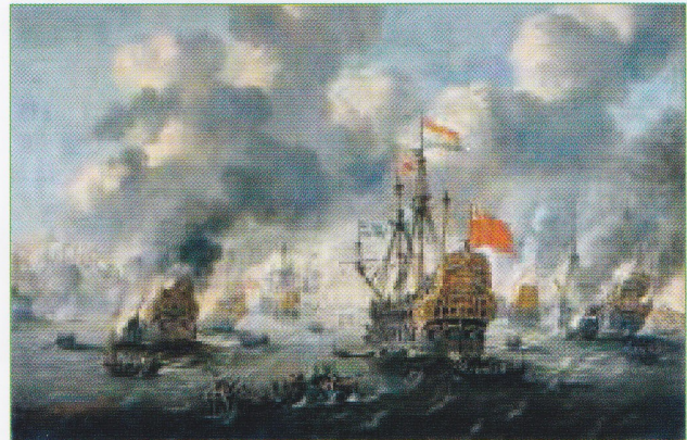
Fig 1 Many battles were fought between the English (later the British) and the Netherlandish fleets during the four naval wars in the 17 th and 18 th centuries, involving hundreds of warships. Thousands of seamen lost their lives in the fights for the supremacy on the world seas. – 'The Dutch burn down the English fleet before Chatham', Peter van den Velde (1634-after 1723) – Rijksmuseum, Amsterdam

The Lastdrager , belonging to the Verenigde Oostindische Compagnie (V.O.C. [Dutch East India Company]), the first limited company in the world, was a 640-ton flute ship (Fig 2)